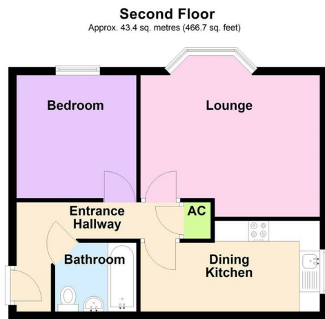
Total area: approx. 43.4 sq. metres (466.7 sq. feet)